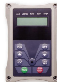
LCD REMOTE KEYPAD FOR CABINET IP66