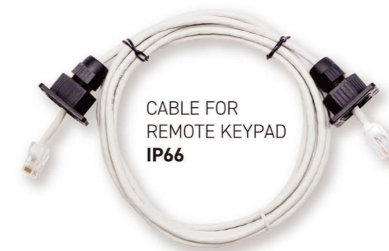
CABLE FOR REMOTE KEYPAD IP66